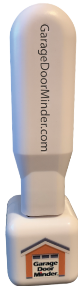
Wall Plug Adapter & Light Stick Receiver